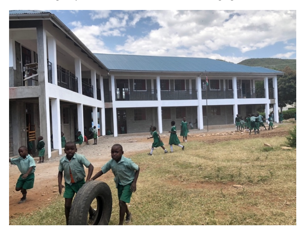
The Mwanzo Education Center

Thanks to our many supporters who have walked with us since 2012, and to a matching grant from One Day's Wages, Mwanzo will be able to complete the two-story Mwanzo Education Center (MEC) in Rabuor. MEC currently serves 202 students from 3 to 13 years old, through grade 5. When at full capacity, MEC will have 480 students through grade 8, and 24 staff.